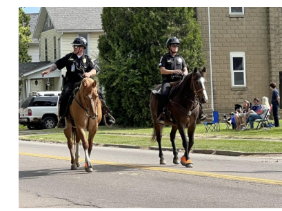
Danville Parade, DPD Mounted Patrol