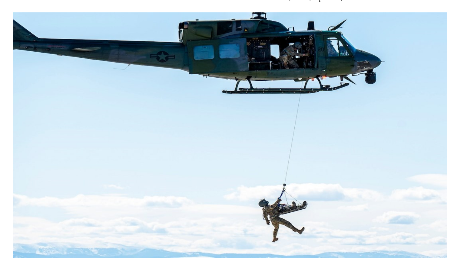
Air Force airmen demonstrate search-and-rescue capabilities at Malmstrom Air Force Base, Mont., April 6, 2023.