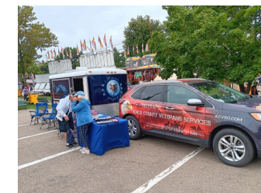
Fredericktown Tomato Festival