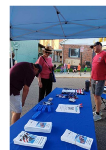
Mount Vernon First Fridays.