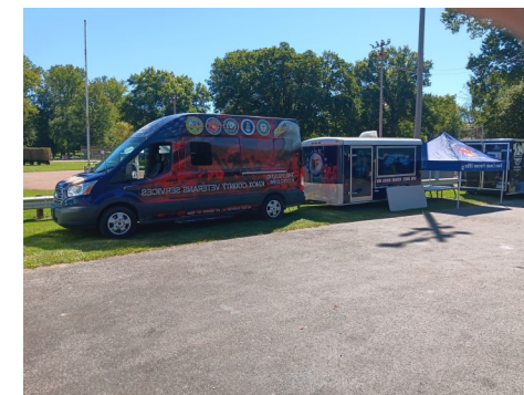
Centerburg Old Time Farming Festival