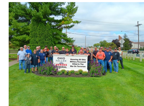
Annual 9/11 motorcycle run to Ohio Fallen Hero's Memorial.

September was a busy month with multiple opportunities to see us all over Knox County. We hope you enjoyed all Knox County offers every summer and fall in the way of festivals and community gatherings!